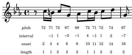
Fig. 1. A monophonic sequence of notes (start of Fugue #2, see Fig. 2), represented by (p, o, \ell) or (\Delta p, o, \ell) triplets. In this example, onsets and lengths are counted in sixteenths, and pitches and intervals are counted in semitones through the MIDI standard.